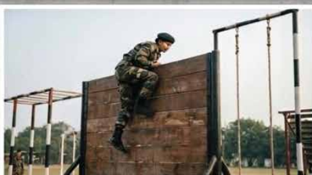
OVERCOMING OBSTACLES: ASSAULT COURSE TRAINING.