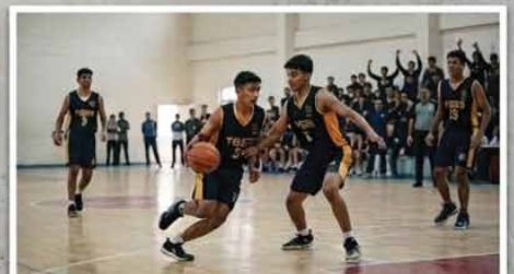
SLAM DUNK: INTER-HOUSE BASKETBALL FINALS.