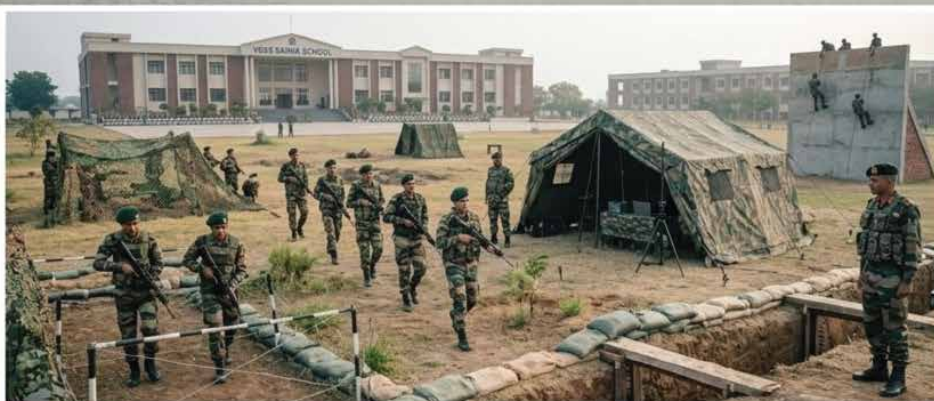
STRATEGY AND FIELD CRAFT: COMBAT TRAINING EXERCISE.