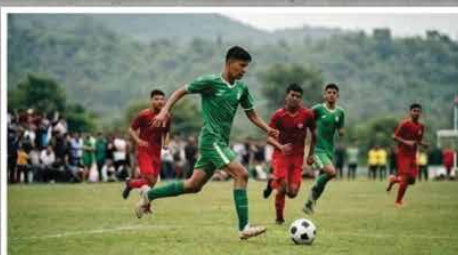
THE BEAUTIFUL GAME: FOOTBALL SEASON.