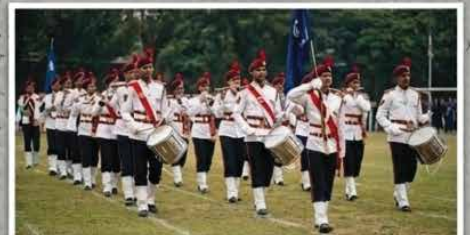
RHYTHM AND PRECISION: MARCHING BAND.